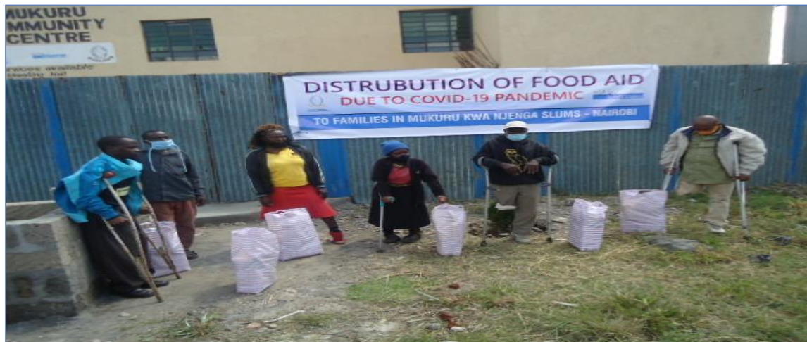
7. Vulnerable Community members with disability receiving their food packages