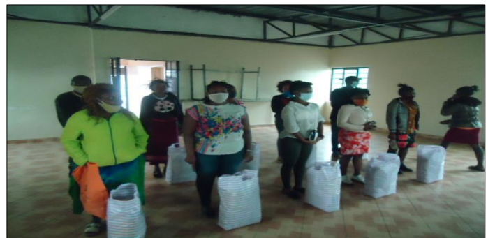
15. Vulnerable Community members with food packages 16.