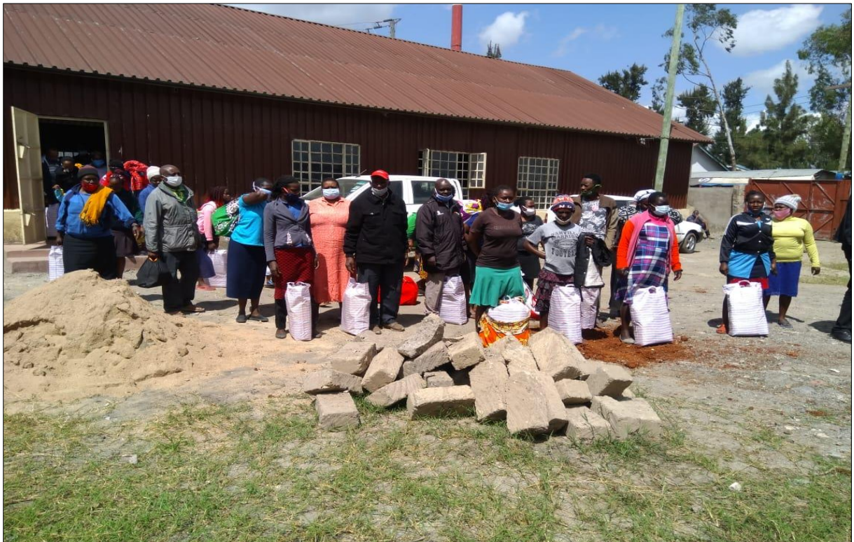
28. Vulnerable church members of the New Apostolic church receiving food packages