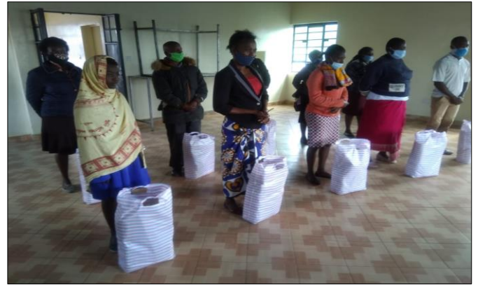
13. Sanitizing hands before receiving food packages 14. Community receiving food packages