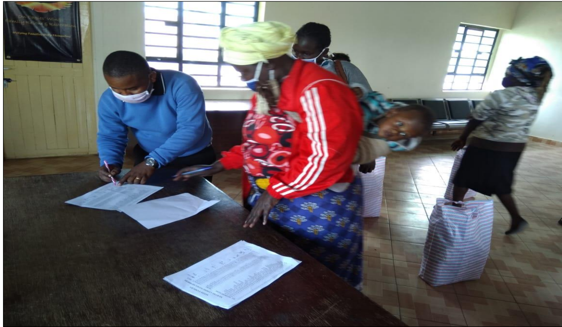
27. Vulnerable community members signing for the food packages