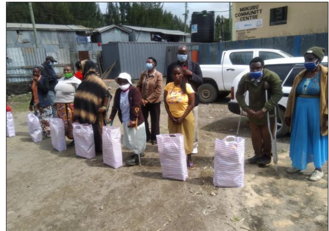
23. Members of persons with disability receiving food packages