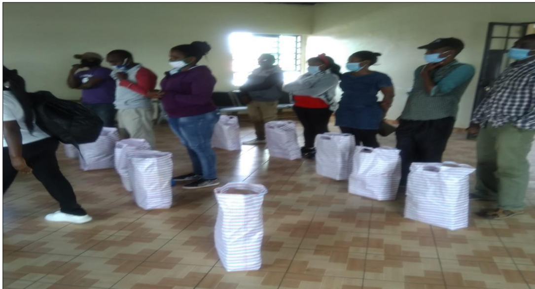
25. Vulnerable Community members receiving food packages