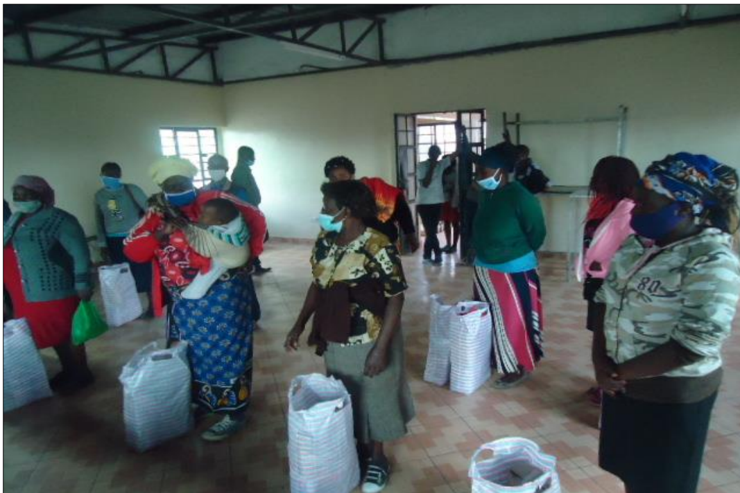
12. Community members receiving food packages at the Mukuru Community center