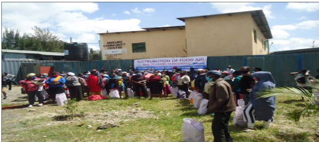
26. Group photo for the Vulnerable community members that received food packages