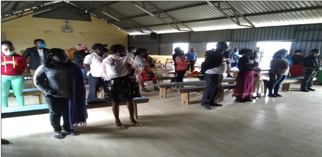
24. New Apostolic Church vulnerable members waiting to receive food packages