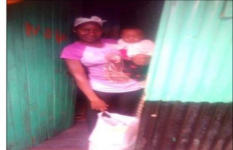
6. Single parent with food package