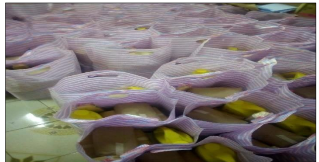
11. Sample food packages