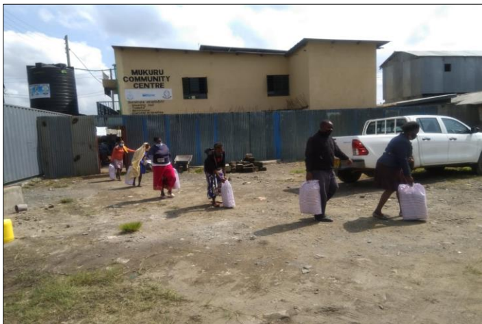
22. Community members leaving with their food packages