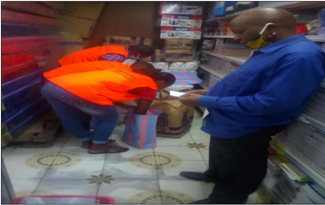
8. Packing of food stuffs at the Elian Supermarket