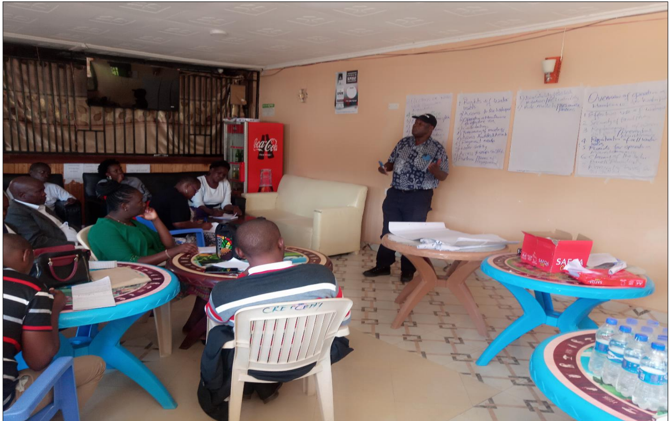
9.0 Programs Coordinator leading discussions on overview of operation and maintenance of water points in plenary