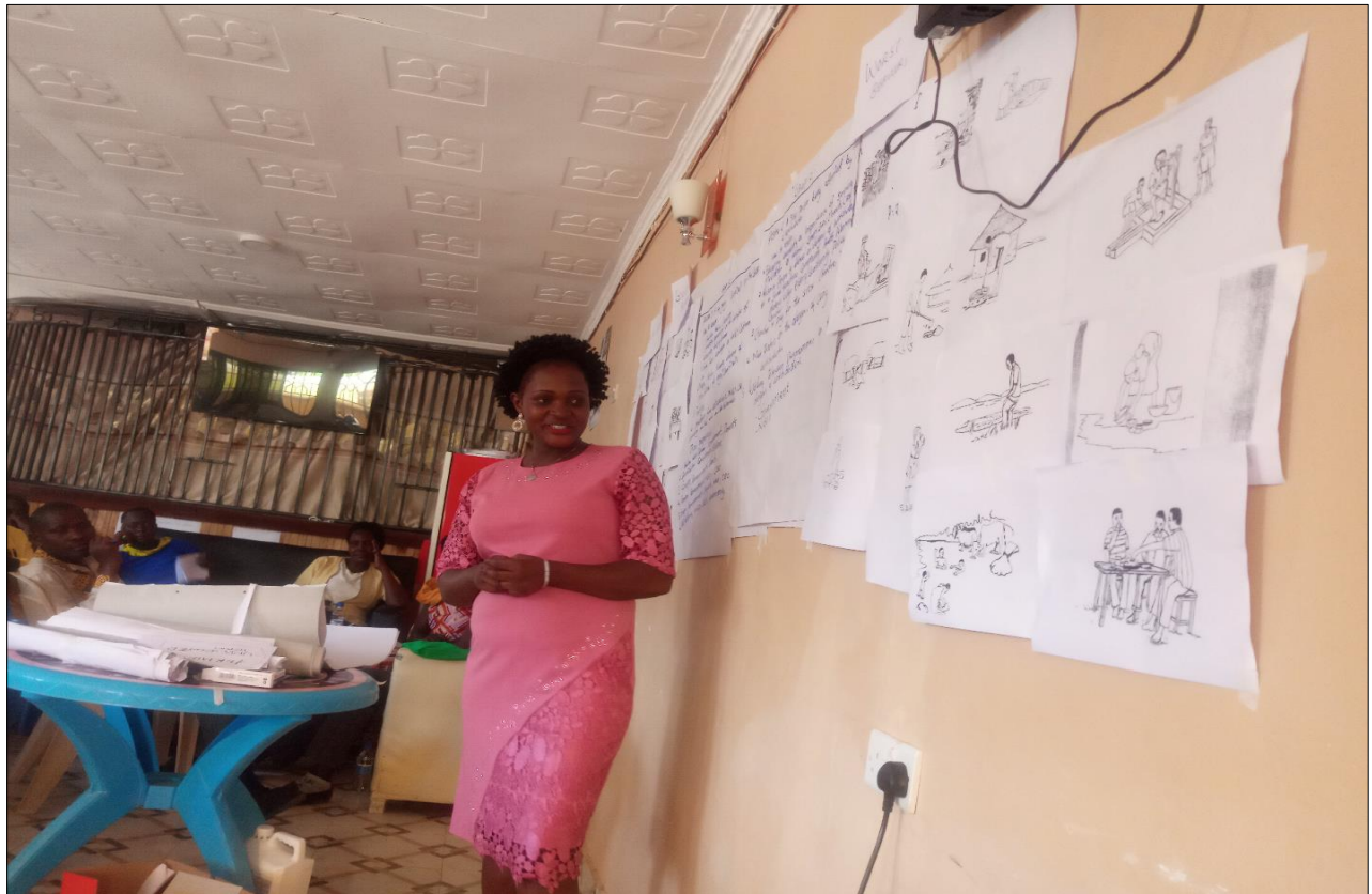
3.0 Group presentations in plenary on hygiene and sanitation behaviors for Water & Sanitation improvements