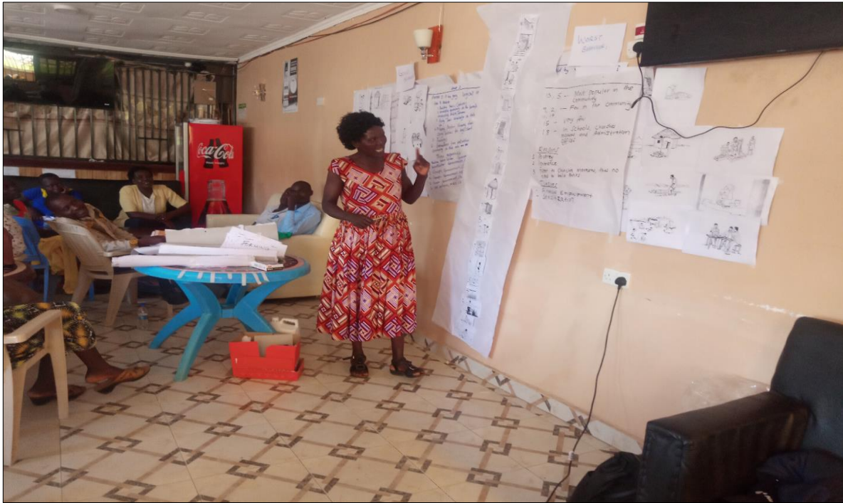
5.0 Presentations on households' sanitation options for Village sanitation improvements