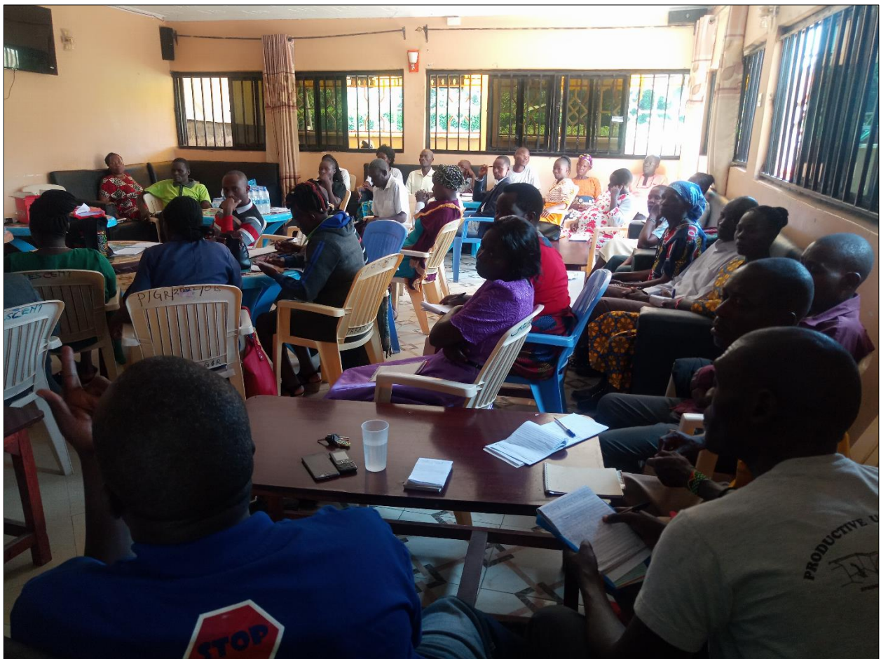
6.0 Participants in plenary sessions during the workshop