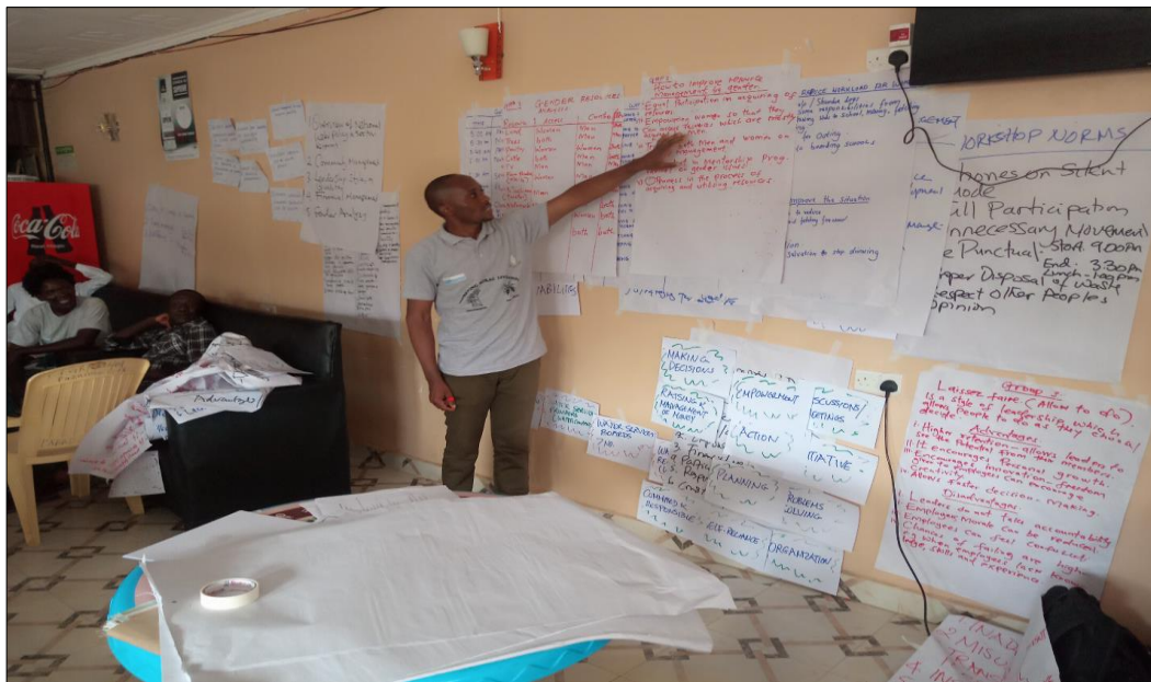
2.0 Group presentations in plenary on Gender Resource Management for Water & Sanitation