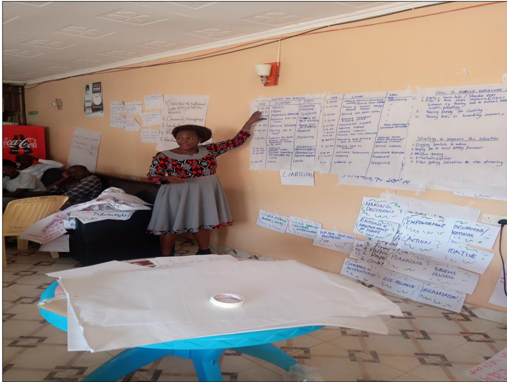
1.0 Group presentations in plenary on Gender and Development in Water & Sanitation programs