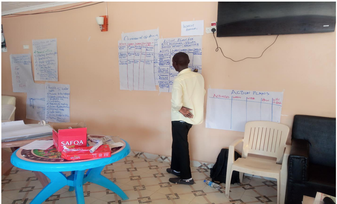
10.0 Presentations of Community Action Plans by Community Water points User Committees