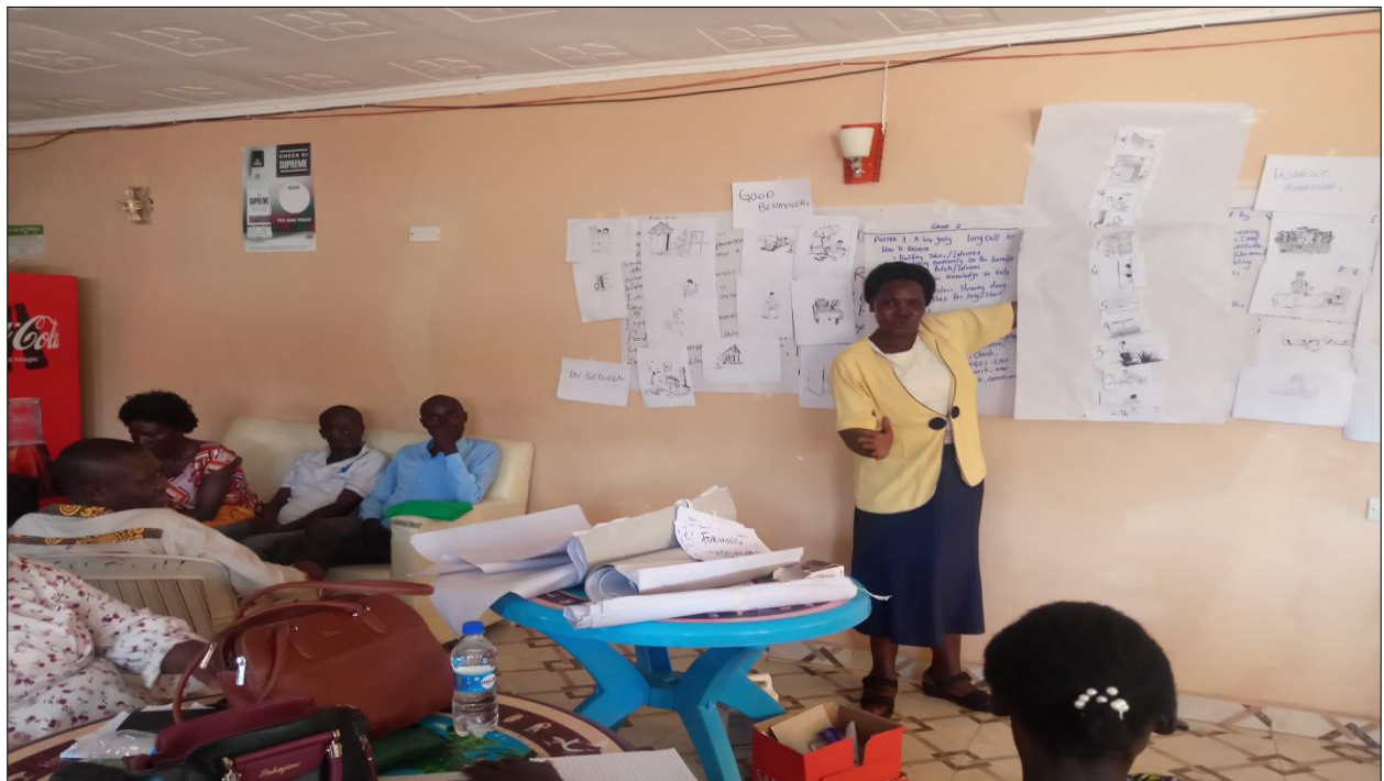
4.0 Group presentation in plenary on sanitation ladder and options for Sanitation improvements at community level and households