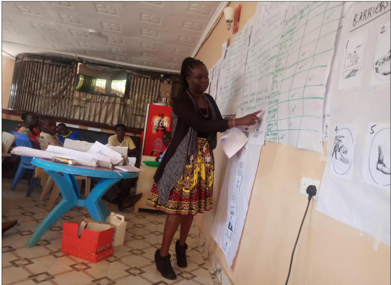
7.0 Plenary presentation on hygiene and sanitation improvements at households and options for community hygiene improvements