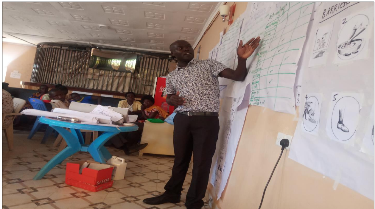
8.0 Plenary group presentation on Leaders qualities and styles for Management of Water points