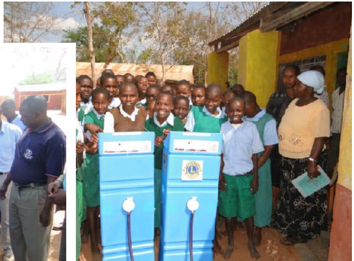
Pauls donated to Ndathani Primary School (Left) & Kimu Primary School (Right)