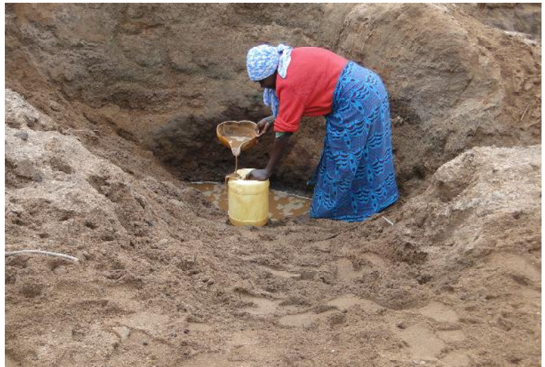
An old lady digging for water in the sand of a dry river bed